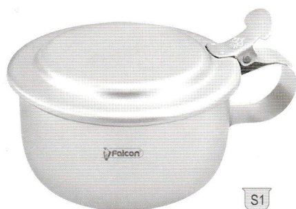
Sputum cup Sputacchiera Spluwaczka