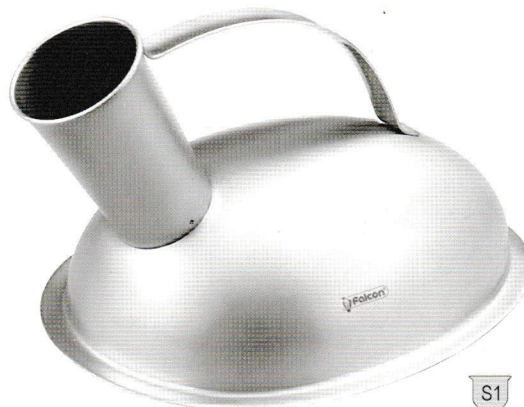
Urinals Urinali Kaczki sanitarne